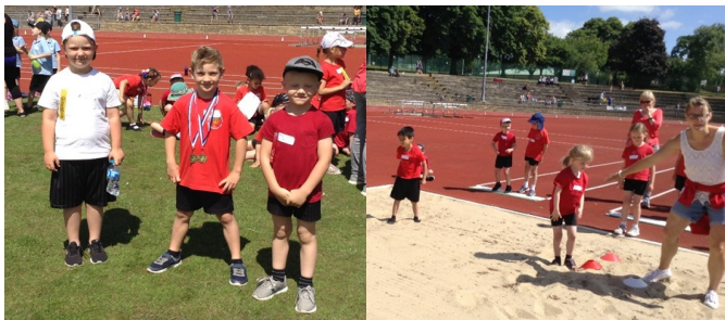
More photos from the Levels Academy Trust Sports Day

Homework Club: Runs Mon-Wed from 3.30pm-4.30pm and is by invitation only . Please speak to your child's teacher.