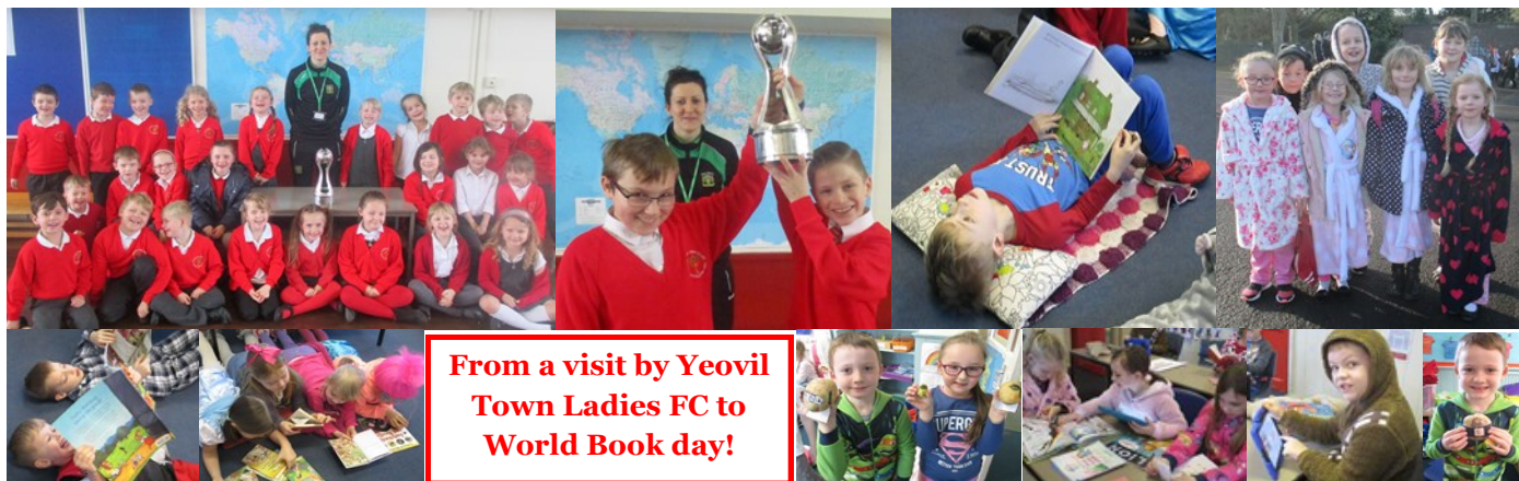
From a visit by Yeovil Town Ladies FC to World Book day!